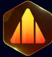
Unity Capital Ventures