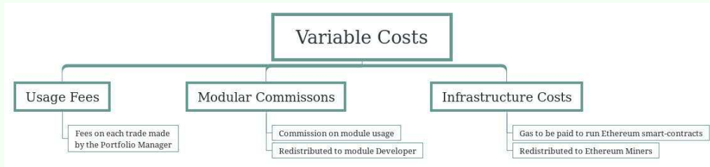
FIGURE 2. Variable Costs of a Melon protocol portfolio